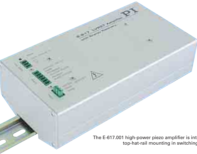
The E-617.001 high-power piezo amplifier is intended for top-hat-rail mounting in switching cabinets