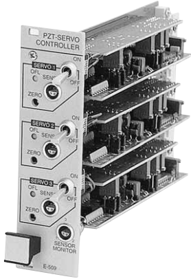
E-509 3-channel servo-controller module for nanopositioning systems with strain gauge sensors