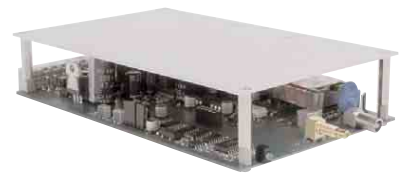
E-617.00F high-power piezo amplifier OEM module

The same functionality and specifications are available in the E-504 amplifier module. see p. 2-148.