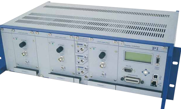
Configuration example: E-500 Chassis with optional modules: E-505, 200 W High-Power piezo amplifier (3 x), E-509.S servo-controller, E-517.i3 24-bit interface / display module