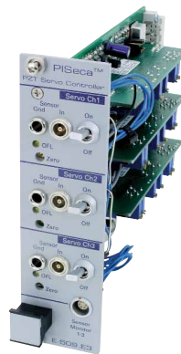
The E-509.E3 module offers sensor signal read-out and servo control for three channels