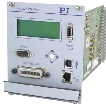
The E-517 piezo display and D/A converter module, provides USB and TCP/IP connectivity