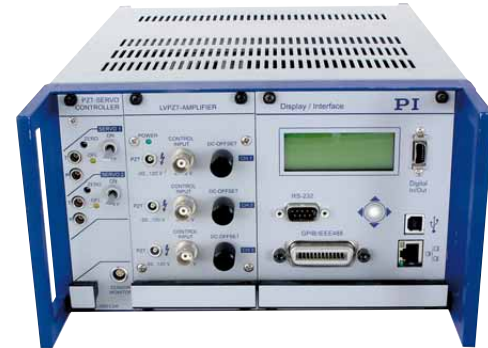
Configuration example: E-501 chassis with optional modules: E-503 piezo amplifier, E-509.C2A servo-controller for capacitive position sensors, E-517.i3 24-bit interface / display module